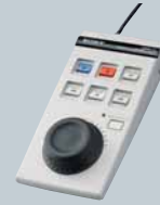
DSRM-10 Remote Control Unit