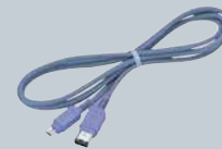
VMC-IL4615B/IL4635B i.LINK cable (6-pin to 4-pin)