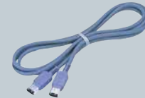
VMC-IL6615B/IL6635B i.LINK cable (6-pin to 6-pin)