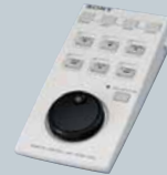
SVRM-100A Remote Control Unit