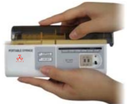
Portable/light in weight