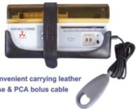
Convenient carrying leather case & PCA bolus cable

Convenient linear-rate setting 1 to 99 mm/hr