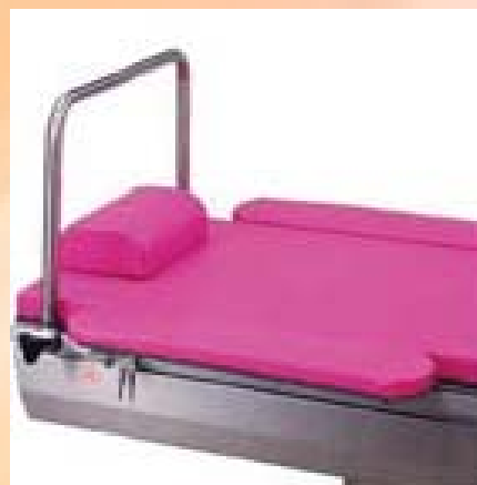
HEAD SIDE HANDLE