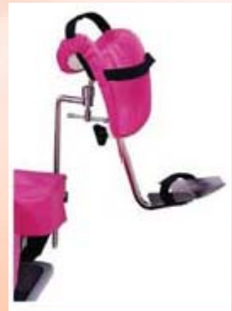
HEAVY TYPE LEG CRUTCHES