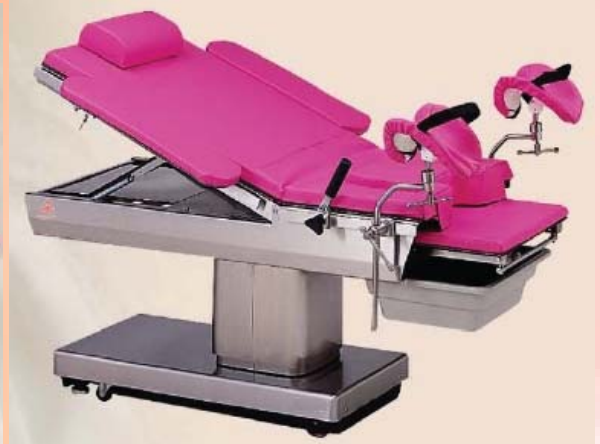
AUXILIARY TABLE APPLICATION