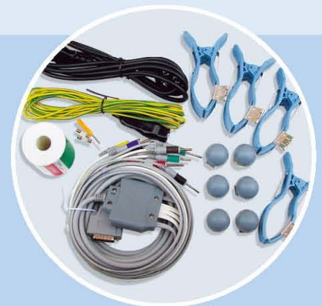
■ Standard Accessory