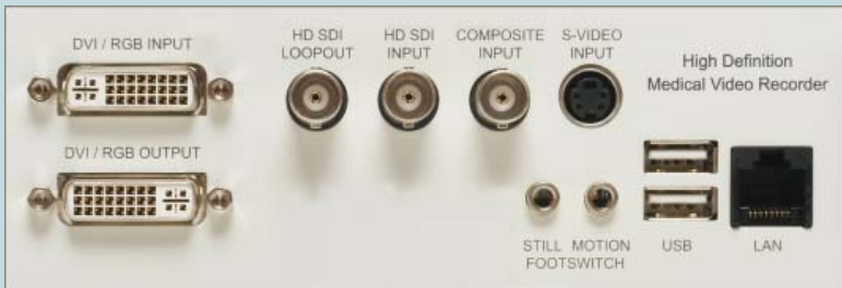
Back Panel Connectors

Connect to your scope's trigger or to a foot pedal (optional)